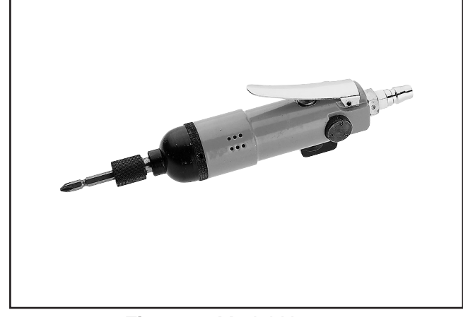
Figure 1. Model H3274.